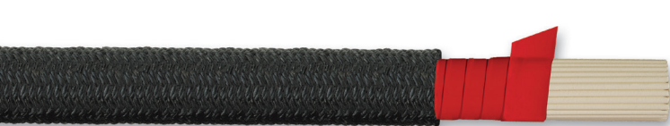
Uniline T&D (double-wrap tape)