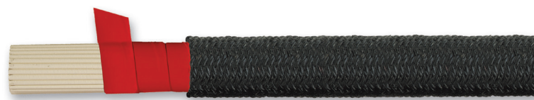
Uniline ND (single-wrap tape)