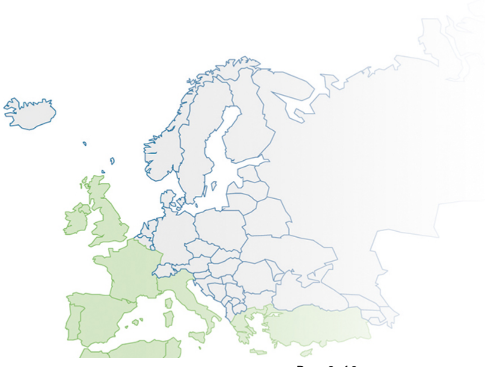
Page 2 of 3 © Honeywell International Inc.