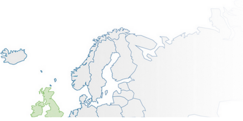
Page 2 of 3 © Honeywell International Inc.

Phone: +33 (0)2 48 52 40 42 Email: techniserv.hsp@honeywell.com