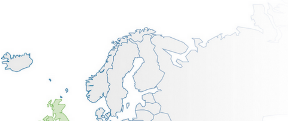
Page 2 of 3 © Honeywell International Inc.

Phone: +33 (0)2 48 52 40 42 Email: techniserv.hsp@honeywell.com