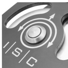
Bushings Ideal for high loads at low speed