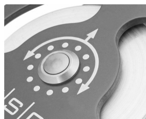
Roller Bearings Ideal for low loads at high speed