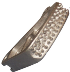
Coned Cam Profile for minimal rope wear.