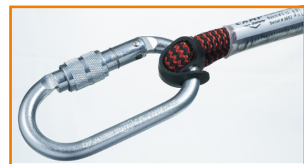
(Connectors supplied separately)

The only scope of this chart is to compare dynamic performance of the two models. Do not use any EN 354 lanyard for fall-arrest purposes without connecting it to a EN 355 energy absorber.