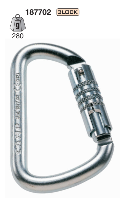
Automatic lock requires three actions: slide, twist and open.

Automatic lock requires two actions: twist and open.