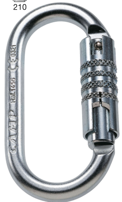
Automatic lock requires three actions: slide, twist and open.