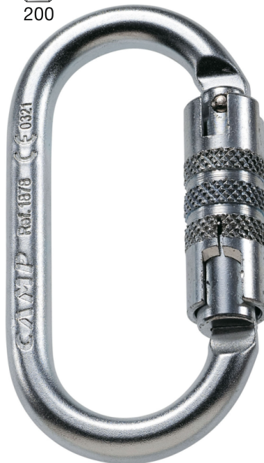
Automatic lock requires two actions: twist and open.