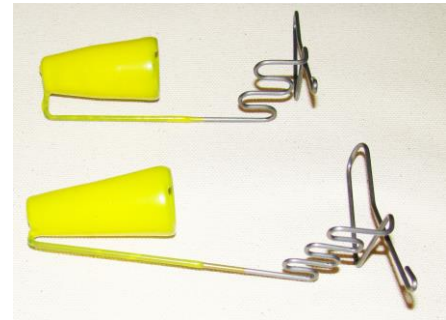
MODEL # 6909TU