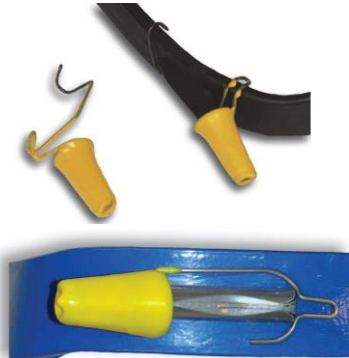
MODEL # 6909A